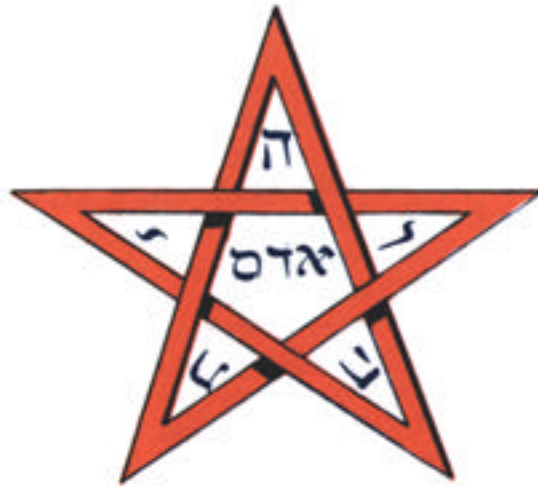
THE PENTAGRAM. Seal of the Microcosm.