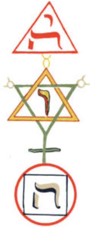
THE TETRAGRAM. traced in a Kabbalistic design.