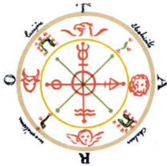
THE WHEEL OF EZEKIEL.